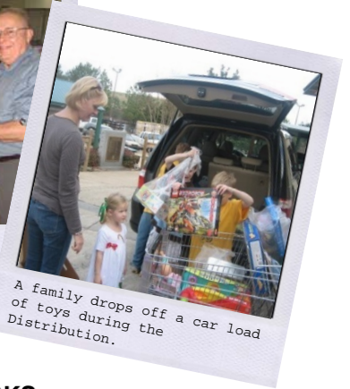
A family drops off a car load of toys during the Distribution.