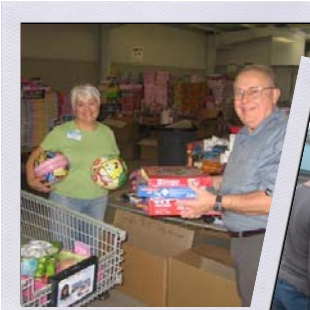
Volunteers help sort toys at the Distribution site.

Cobb Christmas, Inc. is a non-profit, 501(c)(3), all-volunteer organization started in 1963 by The Center for Family Resources (then known as the Cobb County Emergency Aid Association, Inc.) to assist the low-income and working poor families of Cobb County at Christmas time. The early years were made possible through community involvement from groups such as the American Legion, Cobb Jaycees and United Way of Cobb County. In 1978 the Christmas program became independent and incorporated in 1980. Today Cobb Christmas is the oldest and largest program of its kind in the county.