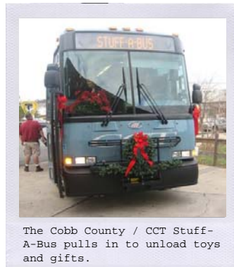
The Cobb County / CCT Stuff-A-Bus pulls in to unload toys and gifts.